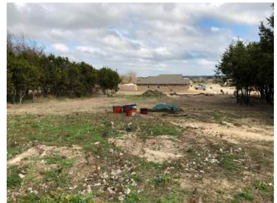
Cleared space for future park development