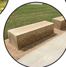
STONE CUT BENCHES