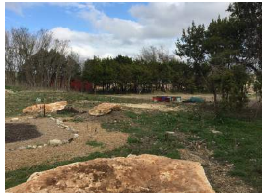
Park space behind the Boys & Girls Club