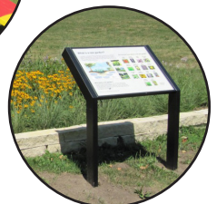
NATURE INFO SIGNS