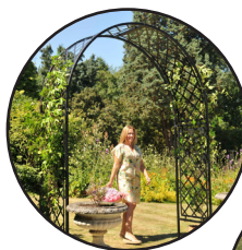
GARDEN TRELLIS ENTRANCE