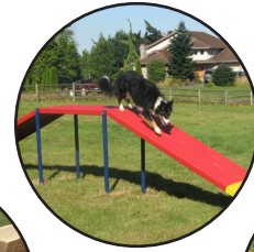
DOG PARK OBSTACLE TOYS