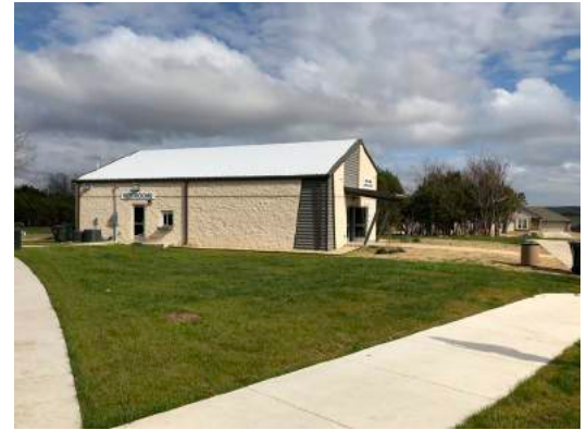
Looking toward the Boys & Girls Club