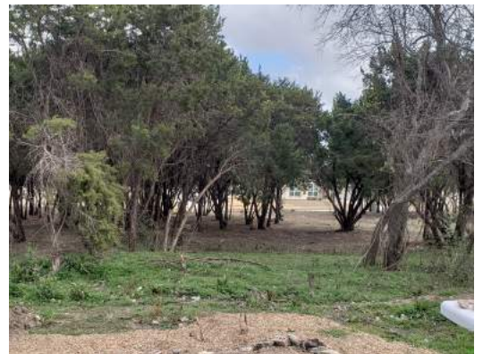
Nature preserve park space